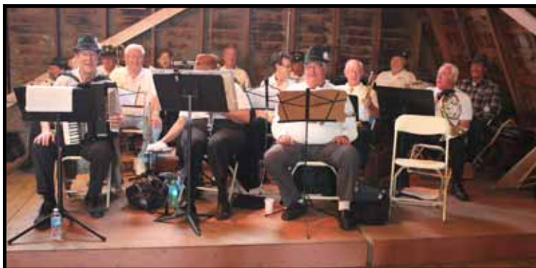
The German Band performing at the Fish Fry.

The Fish Fry was fairly well attended, although there were fewer people than last year. We served about