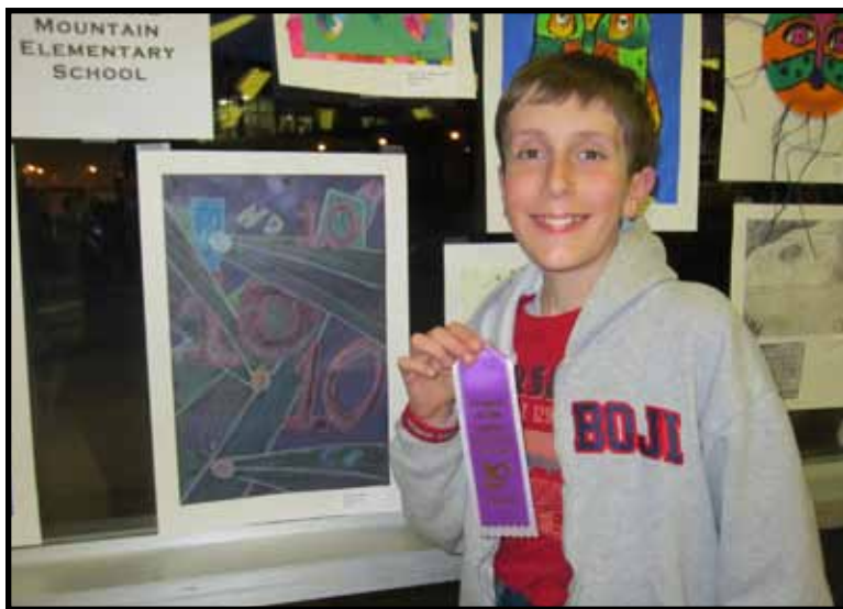
(Shriner Child, continued from left)

twelve, so he will be able to have his spine fused. With a fused spine, he will be free of the brace and other devices.