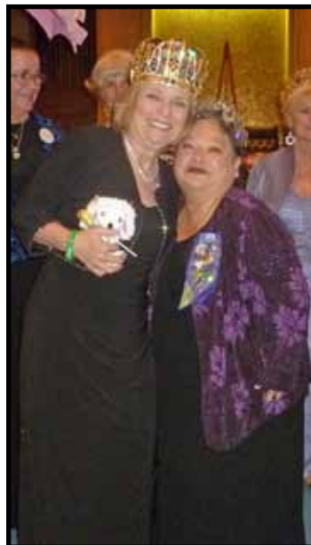
Supreme Queen's Official Visit.