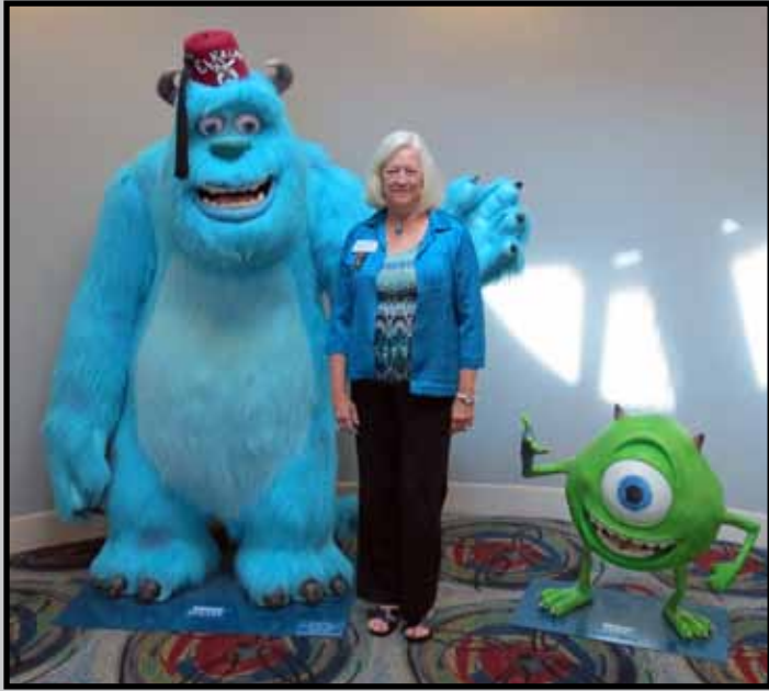
(First Lady, continued from page 3)

was hard on us folks from dry country. Too bad we couldn't air condition the outdoors. But, we attended some great shows as a group, getting discounts along the way. Also, Branson Landing was beautiful. The mist over the river next to the campground started in the evening and lasted until midmorning. It reminded me of "Phantom of the Opera" because you could see the tops of boats gliding along silently and mysteriously.