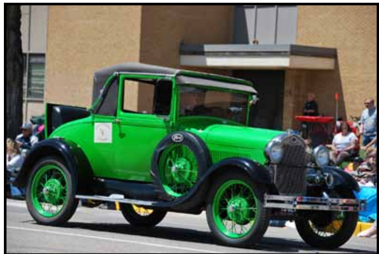
Dick Sater's 1929 Model A.