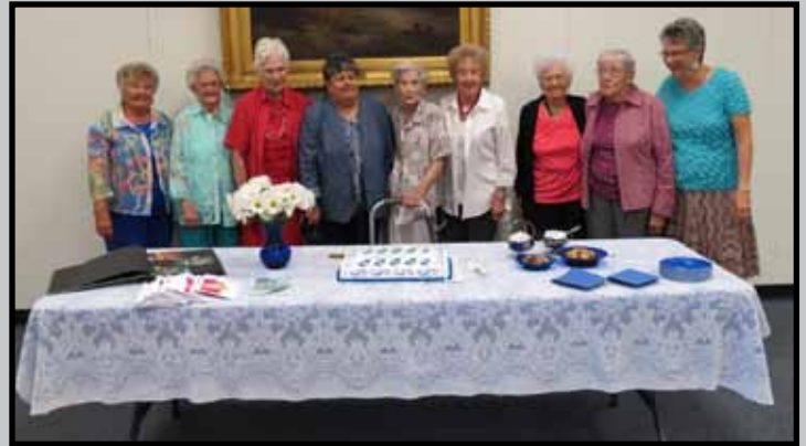
Presidents though the years.