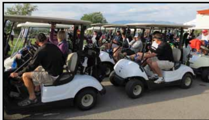
Local business owners and their employees helped raise $50,000 playing golf in support of the SLC Shriners Hospital.