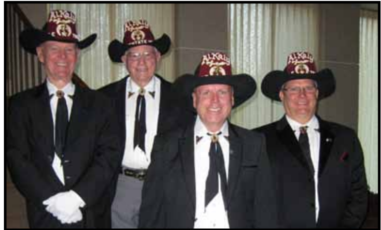
Escorts at the Daughters of the Nile Supreme Queen Official Visit.

All of us from the Mule Train wish everyone a very happy Thanksgiving!!