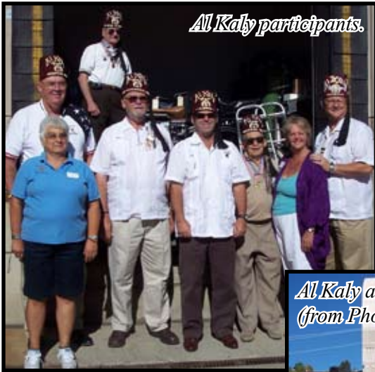
Al Kaly participants.