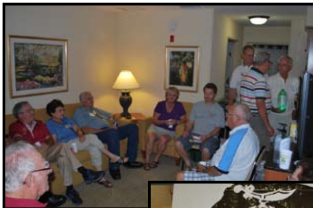
Left: Hospitality Room provided by the Al Kaly Band.