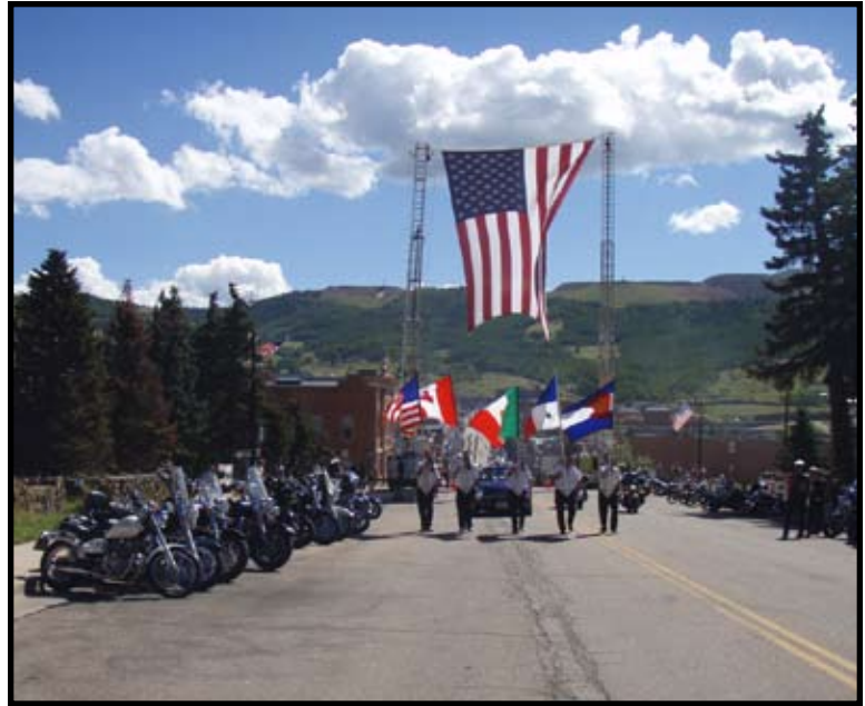
Legion of Honor at the Cripple Creek Parade.

October is always a big month for the Shrine Band: the Swingin' Shriners Dance Band will have played for the October Dinner Meeting at the Consistory on the 6th; the German Ensemble will have played for several Octoberfests: on the 2nd at Divine Redeemer Catholic School, on the 9th at Regent Retirement Center and at Belcaro Apartments (retirement center) on the 12th. In addition, all the band units will have presented a concert at the Veterans' Home in Walsenburg on the 16th (Fez Band, German Ensemble, Swingin' Shriners and Dixielanders). Yes, a fine Fall day and a great Fall!