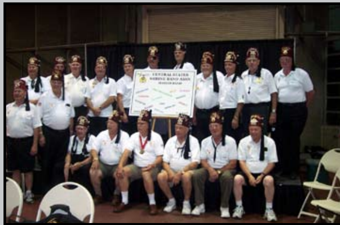
Multiple Bands from throughout CSSA came together in Oklahoma City as part of CSSBA.