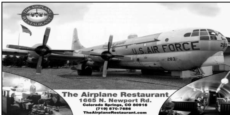
The Airplane Restaurant 1665 N. Newport Rd. Colorado Springs, CO 80916 (719) 570-7666 TheAirplaneRestaurant.com