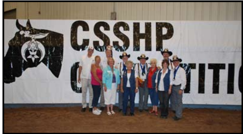
Nobles and their Ladies attending the Central States Shrine Horse Patrol Competition in Oklahoma City.