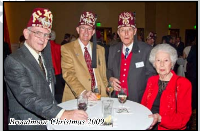
Broadmoor Christmas 2009