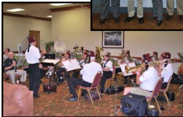
Below: Band members come together to entertain at CSSA.