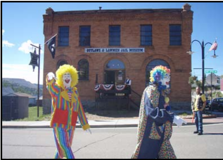
Clowns at the Cripple Creek Parade.