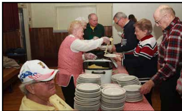
Legion of Honor Spaghetti Dinner.