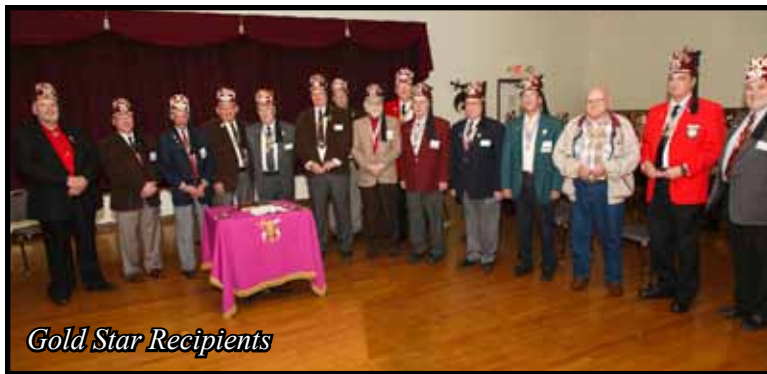
Gold Star Recipients

Congratulations to the following nobles that received awards at the March 21, 2014 Stated Meeting: