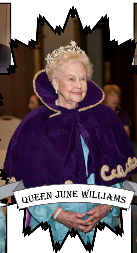
QUEEN JUNE WILLIAMS