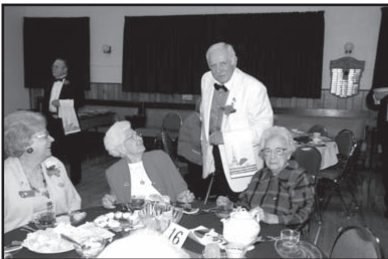
A few scenes from the Daughters of the Nile High Tea.