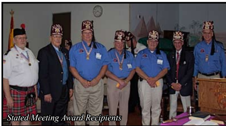
Stated Meeting Award Recipients

Congratulations to Nobles that received awards at the May 11, 2012 Stated Meeting.