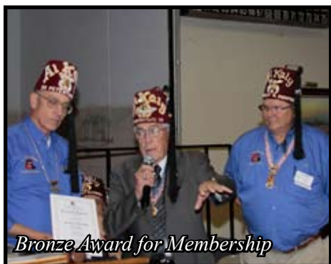
Bronze Award for Membership