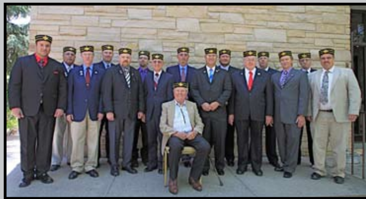
Scottish Rite Reunion group photo.