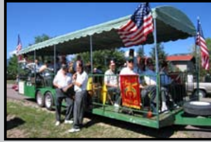
Above: The Band taking it easy as we wait for the parade line-up to start.

Summer has us pulling weeds, cleaning outside, fixing up, and all those things you have to do for a building. We have new lights at the driveways to show you where to turn after dark and are they nice!! Thanks to our Board of Directors and Trustees the building is getting a long needed checkup and many repairs. The new electric meter has made a