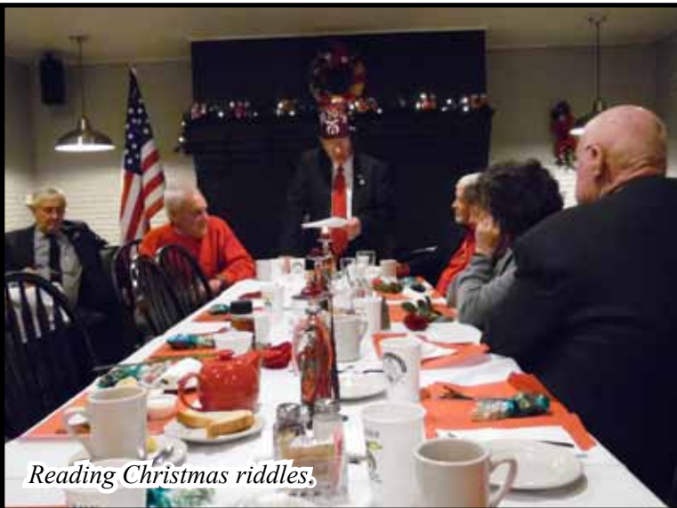
Reading Christmas riddles.