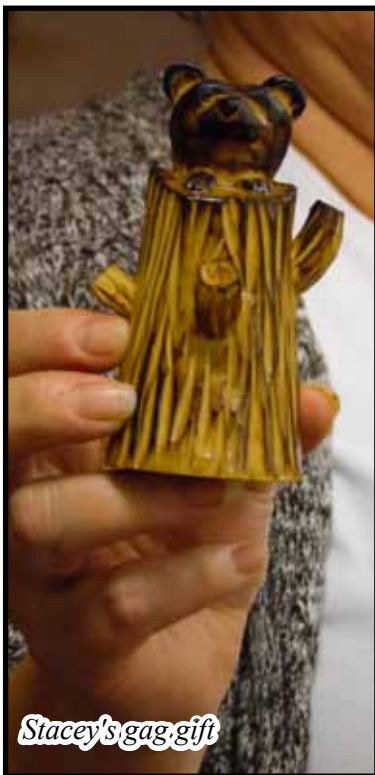
Stacey's gag gift