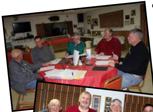
Mule Train Board Meeting