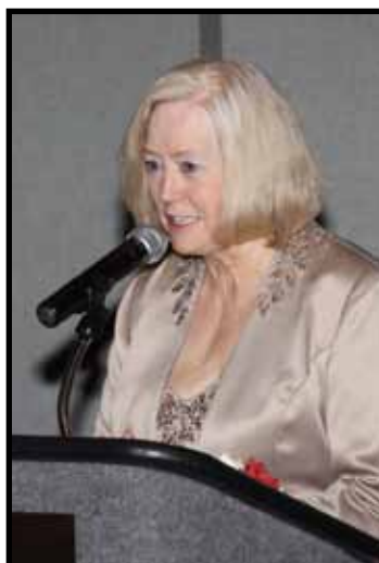
The First Lady at the Ladies' Installation Dinner.