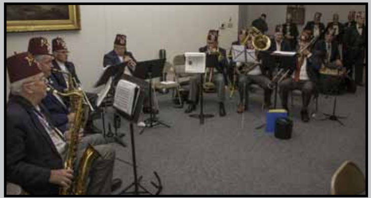
Band at the Installation of Officers Ceremony.

on the Shrine and getting the sound out on every occasion we can to beat the drum for the sake of the children. How many parades and performances are we doing this year? What is the priority for them? What is the weather going to be like? Are gas prices going down? Can we afford it even if it doesn't? How do we recruit new members and take care of the existing ones? All things we encounter as we put the Band together for the year.