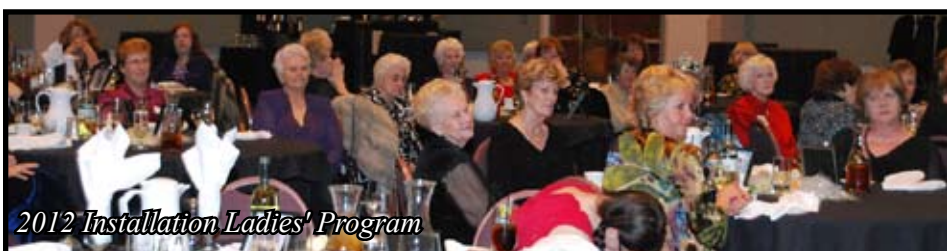
2012 Installation Ladies' Program