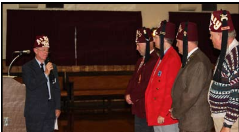
Installation of Officers at the Christmas party.