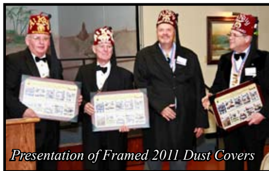
Presentation of Framed 2011 Dust Covers