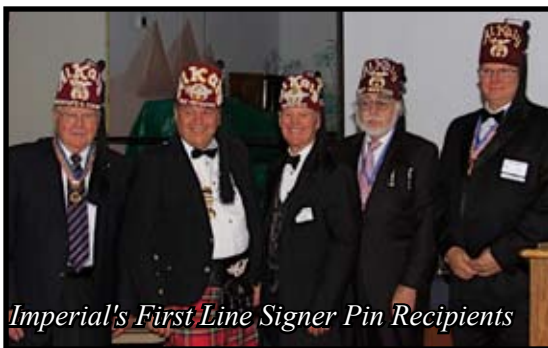
Imperial's First Line Signer Pin Recipients