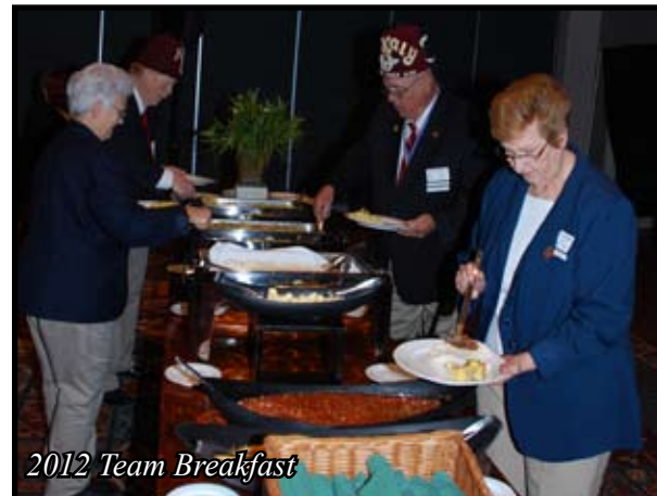
2012 Team Breakfast