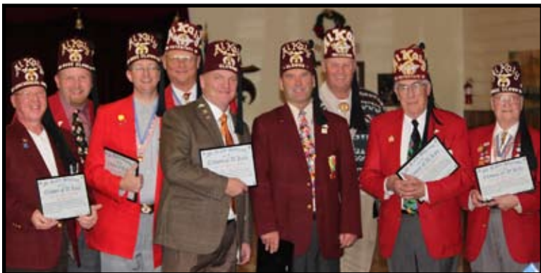
Award winners at the Clowns Christmas party.