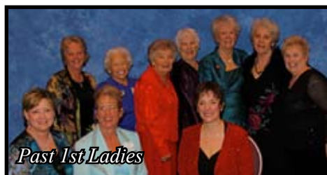
Past 1st Ladies