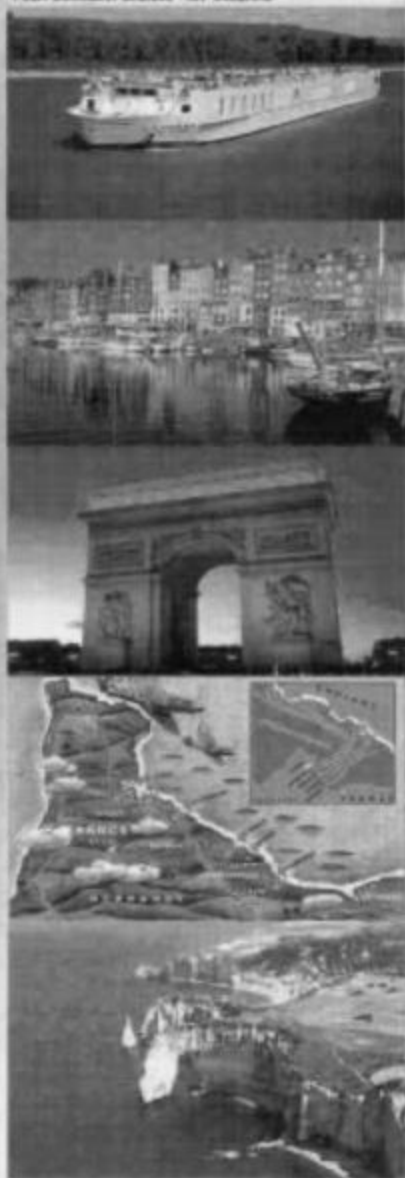
Peter Deilmann Cruises - M/V Cezanne