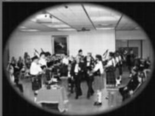
Pipes and Drums