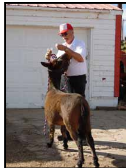
Gimme a treat!