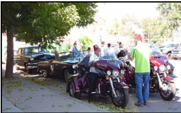
Lining up for the 21 parades.