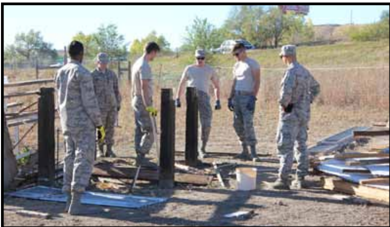
We don't need a tractor...

Seems like an excellent program to those of us in the Mule Train!