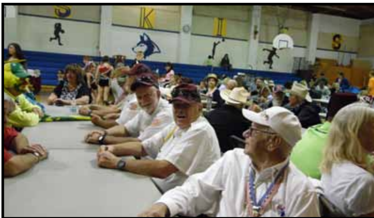
Waiting to sign in.

Bad things...I can't think of one...it was a great day! With very little notice we had enough Shriners show up to make a great showing...THANKS to all!!