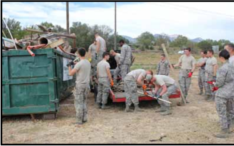
Putting trash into the dumpster.