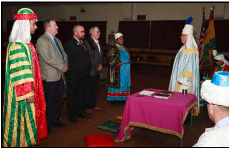
Ceremonial held on October 29