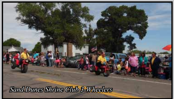
Sand Dunes Shrine Club 3-Wheelers