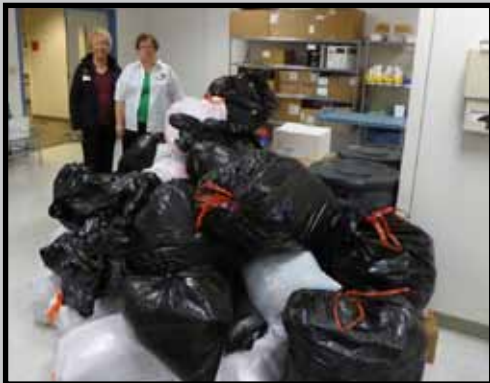
Pounds of pop tabs, collected by the Daughters of the Nile.

"Shriners are a brotherhood of men committed to family, engaged in ongoing personal growth, and dedicated to providing care for children and families in need. Our backgrounds and interests are diverse, but we are bound together by our shared values and a desire to have fun, do good works and build relationships that can last a lifetime." -from the Shriners International website. Happy Holidays!