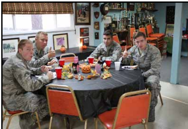
Cadets at the Mule Train breakfast table.

The upper classman quickly picked six other cadets. My squad of seven, who were all taller than I, surrounded me and I said, "Ok, follow me – we'll tear down the announcer's booth. I have hammers, crowbars, and sledge hammers out there already."