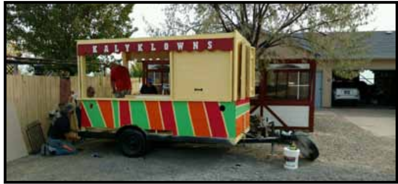
The newly-rebuilt Kalyklown Kalliope.

In November, we will once again be in attendance