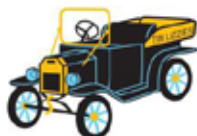
AL KALY SHRINE TIN LIZZIES