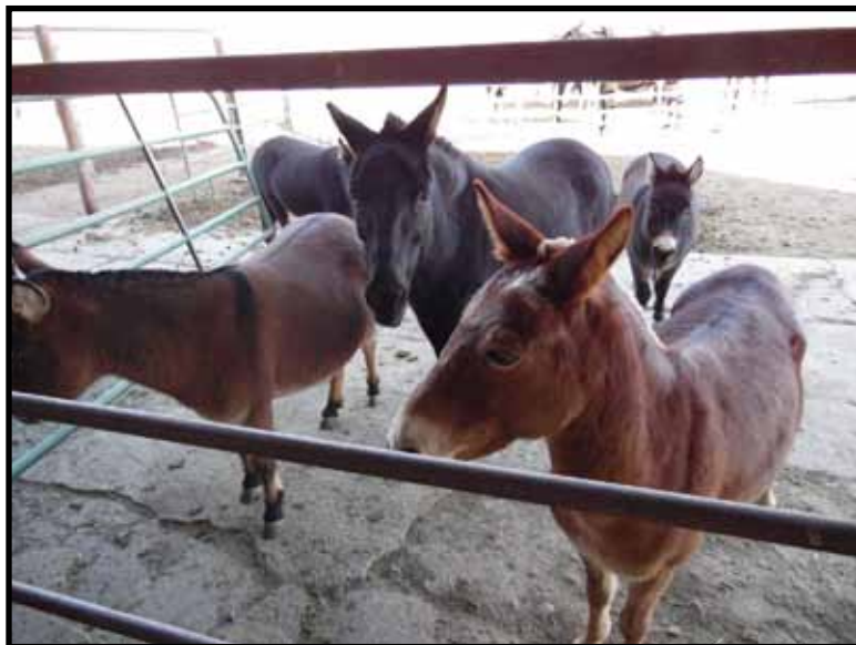
Holly, Joey, ChickaPee and Matilda

You drive into the property and you will see the mules in the pasture or walking in the corral but the minute you walk into the barn...there are the smiles and sparkling eyes of seven little mules (and the big ones slightly farther away) and all of them are talking to you in their hee-haw little way. And...right there in the front row pushing on the fence to get as close as possible are Butch and Sundance.