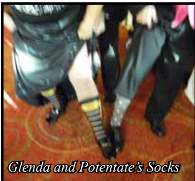
Glenda and Potentate's Socks