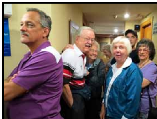
Above and below: Early breakfast at the hotel in Barcelona.