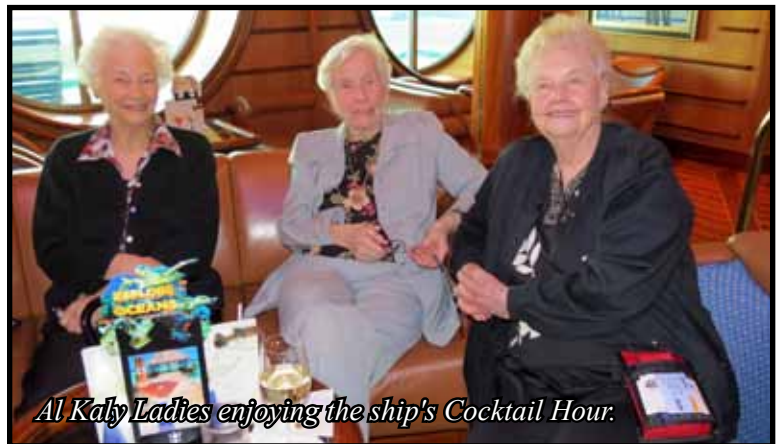
Al Kaly Ladies enjoying the ship's Cocktail Hour.