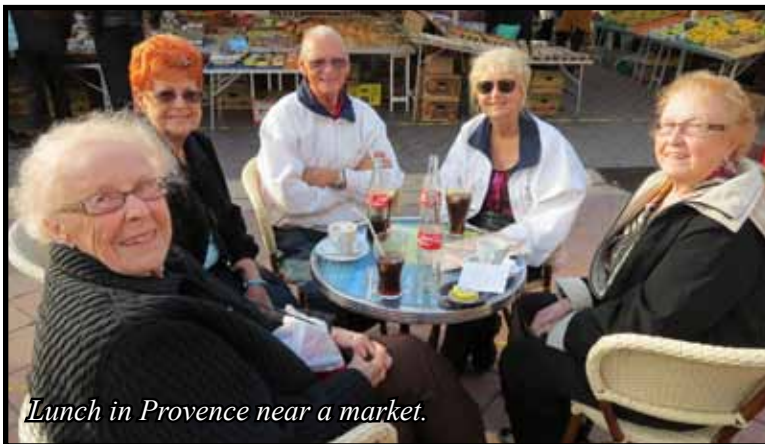
Lunch in Provence near a market.