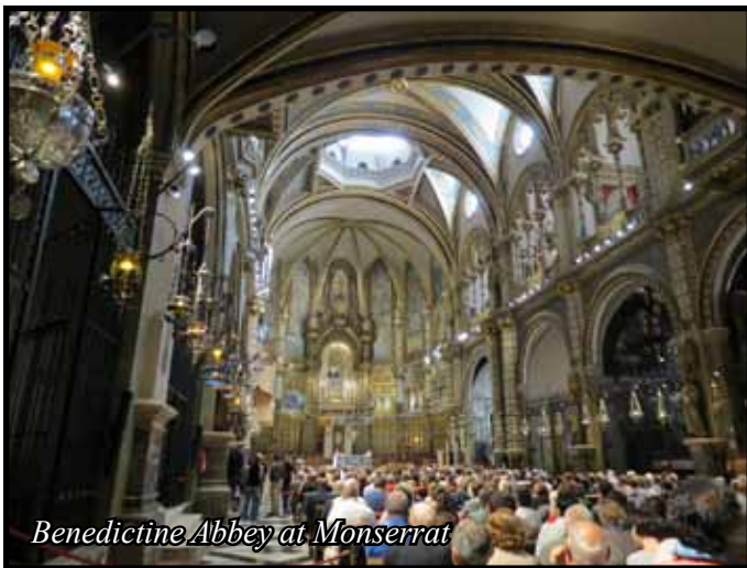
Benedictine Abbey at Montserrat