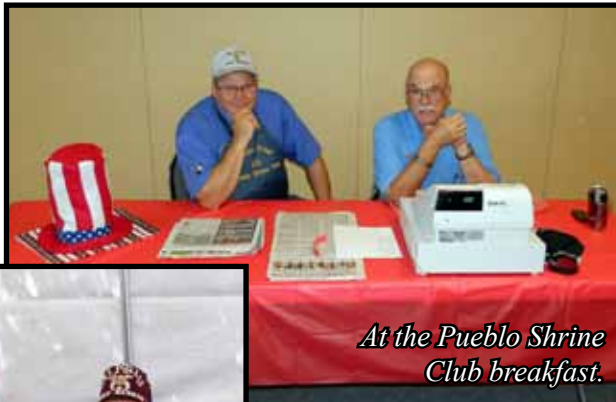
At the Pueblo Shrine Club breakfast.