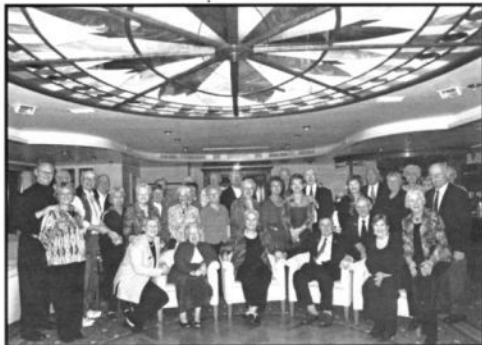
Group photo of the Shrine Trip to France.

Channel! Besides the beaches, we visited the War museum, the beautiful cemetery, beautiful and awesome churches, a Benedictine Abby (where we visited the sampling room – yummy), and a bus tour of the City of Paris. And, of course, there was the ship (lazily cruising down the river on a beautiful day – going through the locks), the wonderful food, and just being spoiled rotten!! To see photos of the trip visit the France Open Album at http://gallery.mac.com/rbills