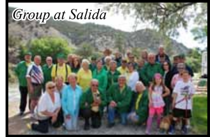
Group at Salida