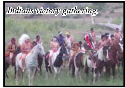
Indians victory gathering.