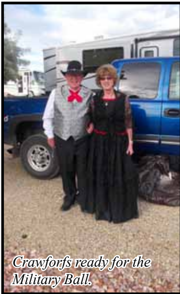
Crawforfs ready for the Military Ball.