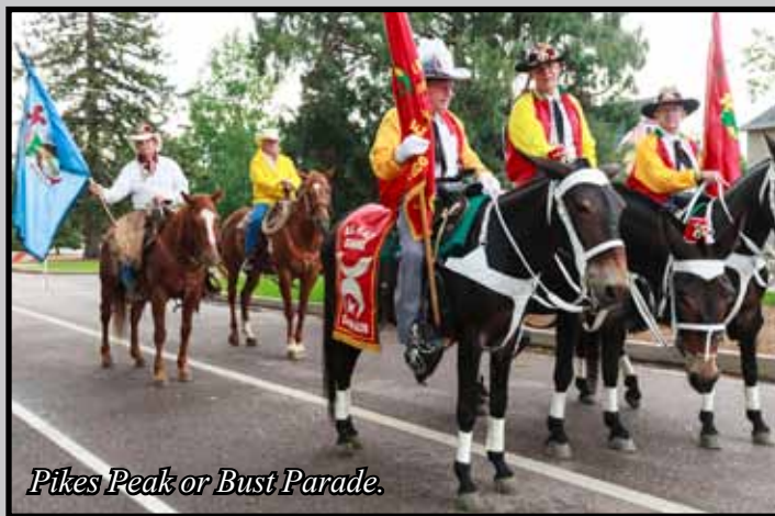
Pikes Peak or Bust Parade.