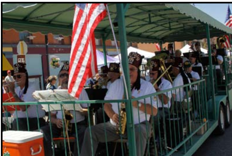
Band at the Cripple Creek Parade.

Wow – what a summer! We’ve all been affected by the Waldo Canyon Fire – the roaring inferno that exploded into west-side Colorado Springs neighborhoods on 23 June, and destroyed 346 homes as the most destructive fire in Colorado History. Those of us that were up in Cripple Creek for Donkey Derby Days, returning home to Colorado Springs saw it as we returned home that day, and thought oh, oh, and the rest is history. As a result, several events we had intended to participate in were cancelled or postponed, and we’re still sorting out the details. A lot of Shriner and Masonic assistance, prayers, and good will was poured out to our brethren and neighborhoods reacting to this disaster. ...And what about the emergency response and disaster relief personnel. These are great Americans who are giving of themselves selflessly for our safety and well being. They are empowered to do their job through the freedoms of this nation. Only a country such as ours can have the excellent government support we have, with the freedom that is actually granted by the citizens to do their jobs. Our way of government and its’ freedoms allow the firefighters, policemen and disaster responders to do their jobs unabated by the tyranny of a government without citizen control. Think what it would be like if we were living in an anarchy or dictatorship. We would not have their same level of support and dedication to their jobs, not to mention the passion they