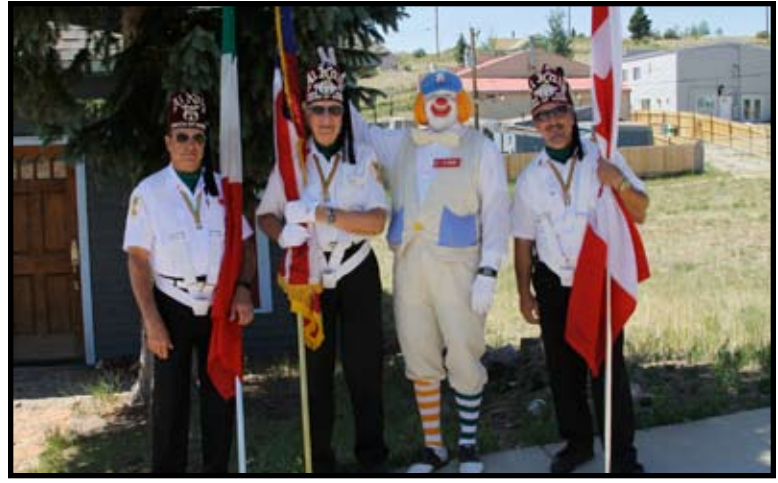
Legion of Honor with a clown at the Cripple Creek Parade.

The months of June and July were filled with excitement. In spite of the Waldo Canyon fire, there are some good things to talk about. June 16 found us all gathered in Salida for the Fib-Ark Parade. What an exciting day it was. The patriotism displayed in that town when the National colors pass can't be measured. We celebrated Father's Day on the 17th; paying tribute to all those fabulous Dads out there. Chasing and racing donkeys was the order of the day on the 23rd at Cripple Creek. Another proud day for Al Kaly, as we majestically marched down Main Street to the applause of an enthusiastic crowd, what a day. Unfortunately, because of the fire, the 4th of July parade was cancelled for this year in Monument. Rightfully so. This would not have been an appropriate time to celebrate with so many in pain. There will always be next year. July 28 will find us on a trek to Monte Vista for one of our long distance parades...get your room reserved before they all go or enjoy the long early morning