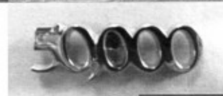
1st Ceremonial Master 1998 Oriental Guide in 1999

"extraordinary contributions to the heritage, culture or mission of the Shrine"