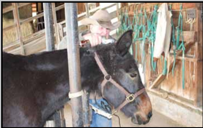
(Mule Train, continued from page 22)