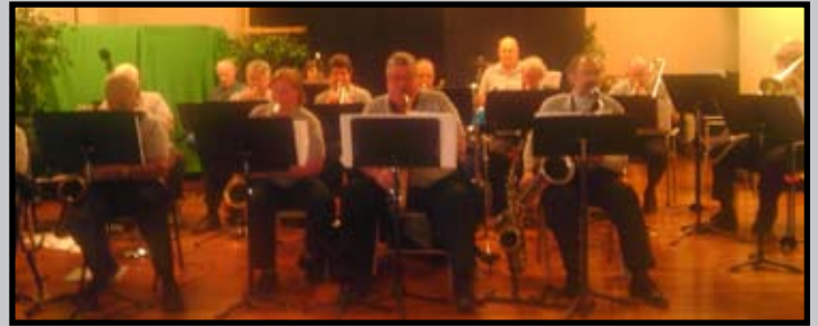
Recent performance by the Swinging Shriners at Village at Skyline.

Please contact any bandsman if you are interested in playing (or just listening) – we'd love to have you come and join us! To reiterate the motto of the Shrine Band Association of North America, "We play so Children Can".