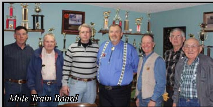
(Mule Train, continued from page 21)

Don't forget breakfasts on the first Sunday of each month...$6 will buy you all you can eat and a great morning of conversation and friendship.