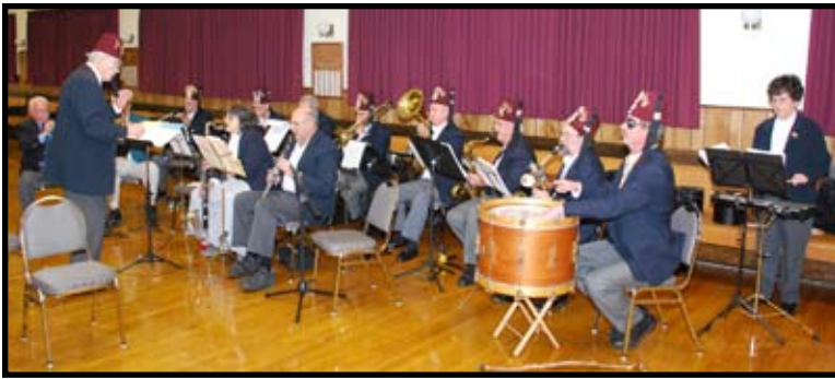
Band playing at the March Stated Meeting.