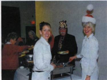
It looks like Santa's helpers have a little Dr Suess in their hat! "I'll have some beans, if they are done, I love green beans they're lots of fun."