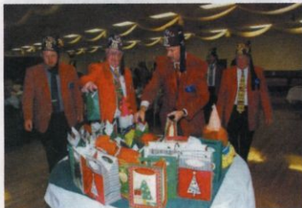
"Okay, so which one did you think was ticking?"